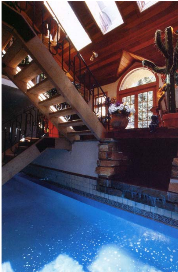
The 50-foot lap pool features a lighted waterfall and decorative tile accents.

The Gray's home genuinely captures a feeling of comfort and mountain charm.